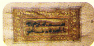
Quran scribed by Hazrat Ali

M.A. Library has introduced state of the art information technology and it is fully automated with LibSys 7.0 software which connects almost all 3,000 computers within the University as well as the centers in distant states. The 3M security system and three dozen CCTV cameras ensure safety of the Library material. Over 8,000 students, teachers and other members visit the Library almost every day.