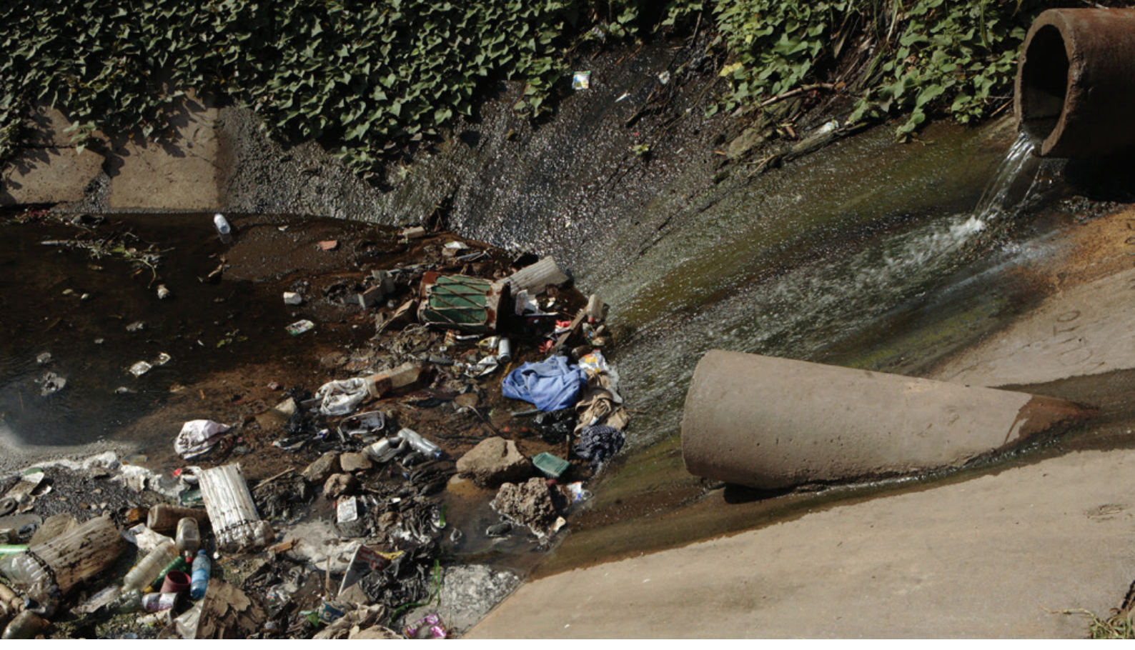
Water, along with pollutants and contaminating agents, flows into a canal in Maputo, Mozambique. (File) Photo: John Hogg / World Bank