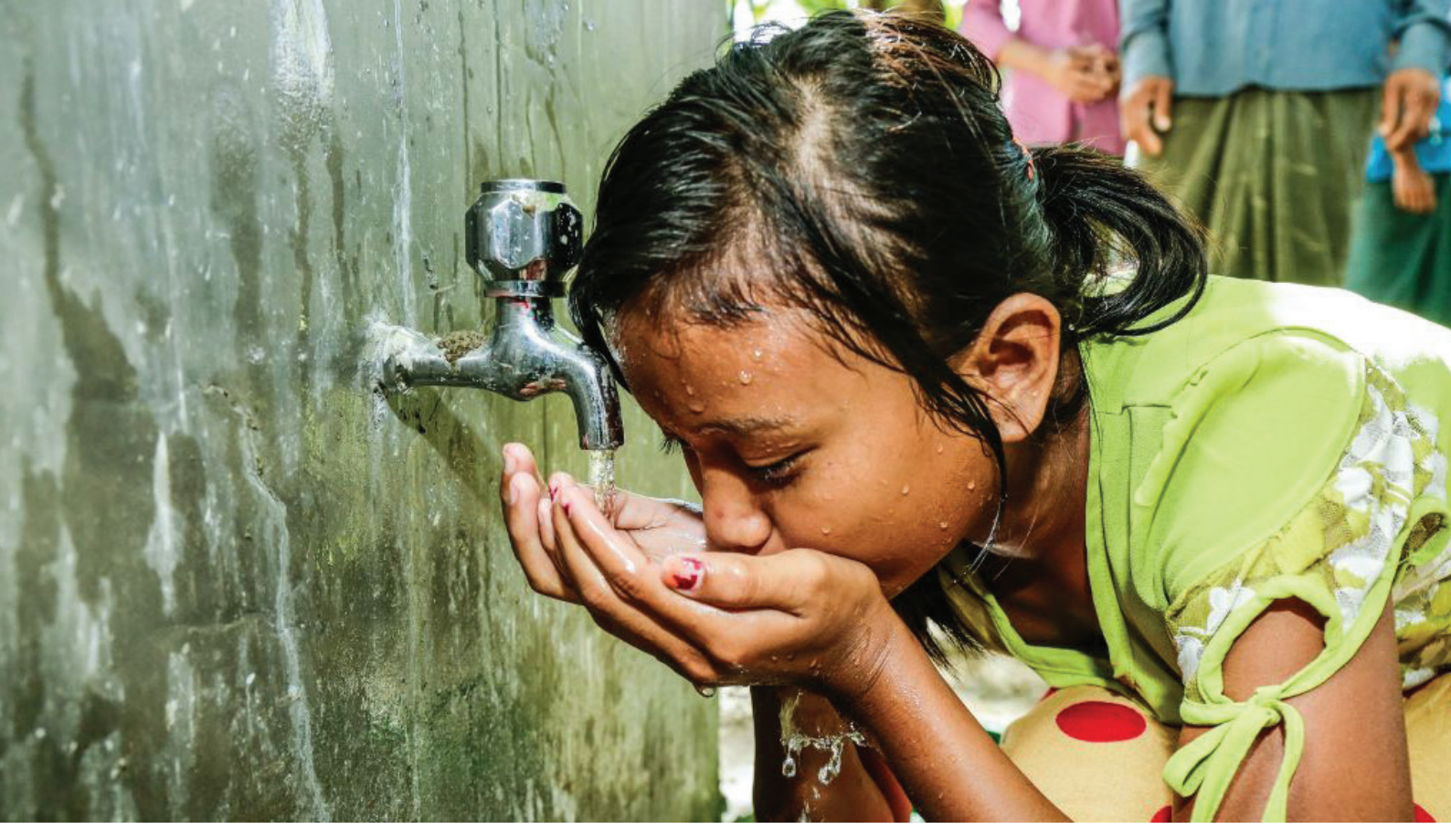
MANILA, PHILIPPINES (25 April 2017) ADB News release — The Asian Development Bank's (ADB) annual operations exceeded the $30 billion mark for the first time in its 50-year history last year as regional demand for development finance and knowledge — particularly on infrastructure — continues to grow, according to the bank's 2016 Annual Report (AR) released today.