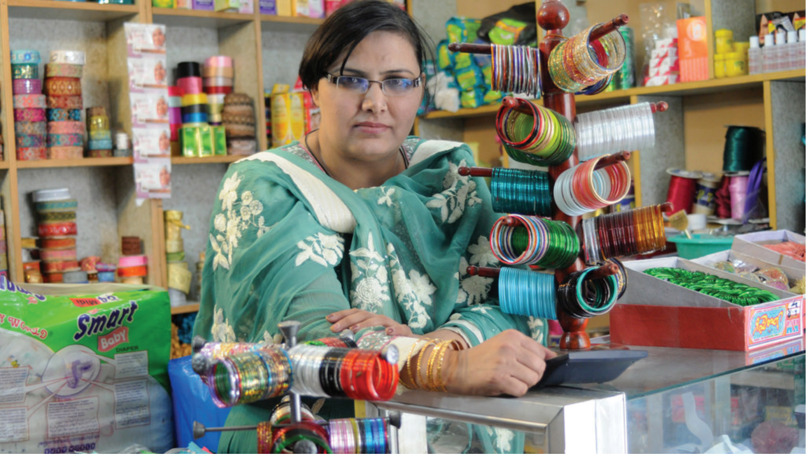
A women sells at her cosmetics shop and general store in Pakistan's Punjab province.