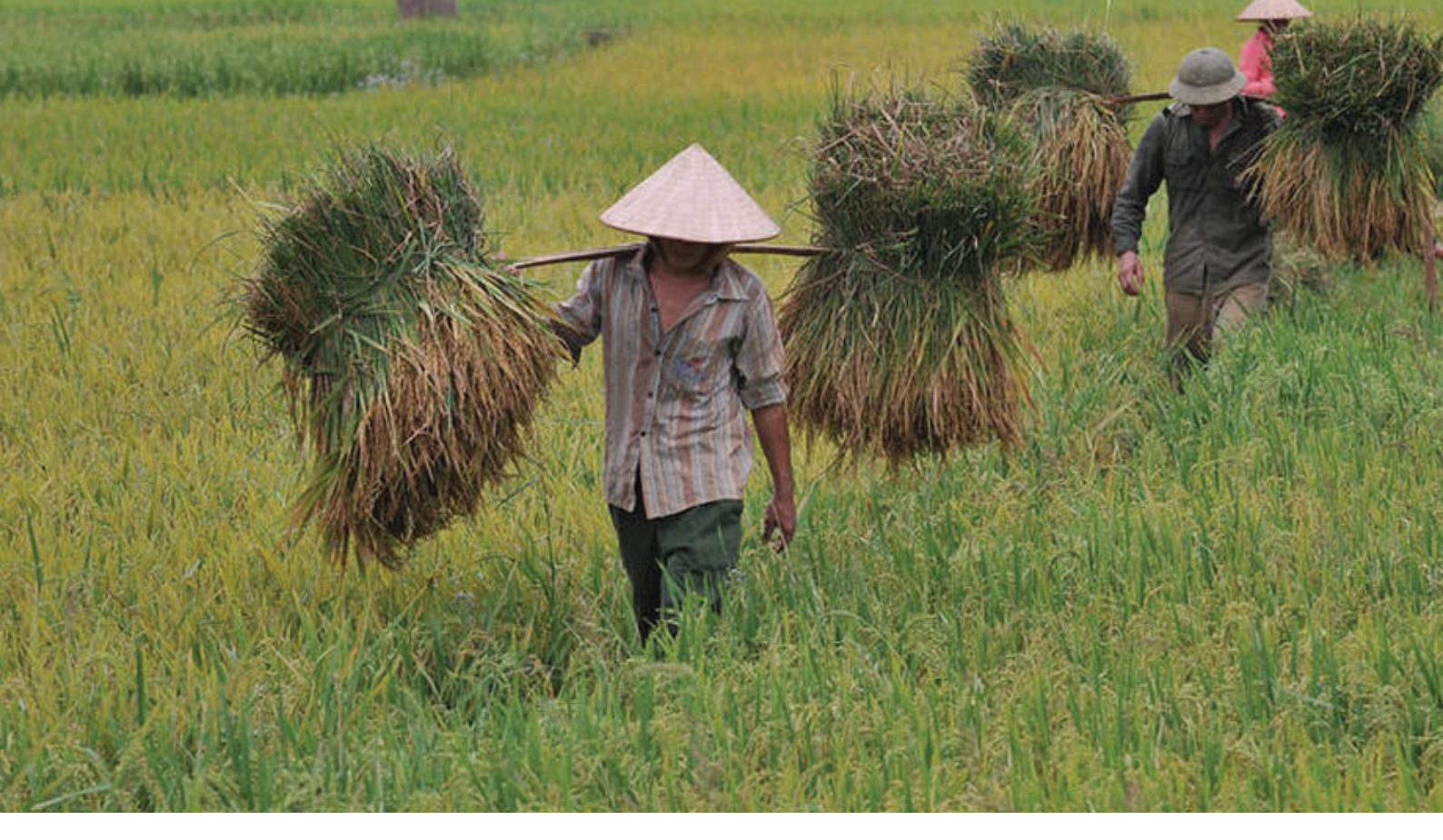
Harvesting rice in Viet Nam. Global rice consumption trends are rising.