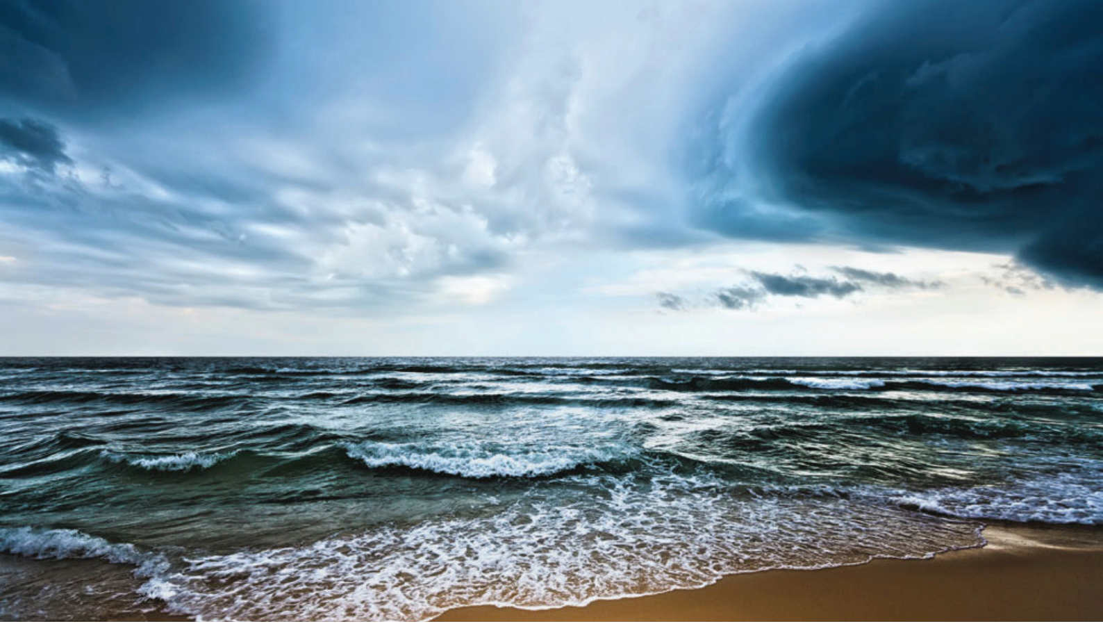
By absorbing much of the added heat trapped by atmospheric greenhouse gases, the oceans are delaying some of the impacts of climate change.