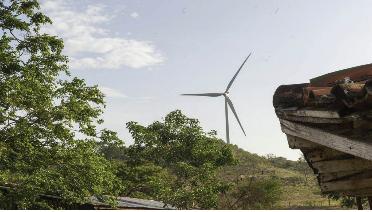
A wind mill at the Parque Eólico Camilo Ortega Saavedra wind farm in the Department of Rivas, Nicaraqua.