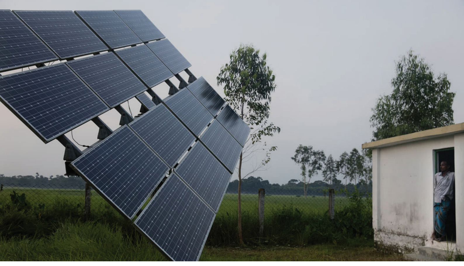
A pump operator for Nusra works near solar panels. Nusra is an NGO working to bring solar irrigation to farmers and solar home systems to families in Rohertek, Bangladesh.