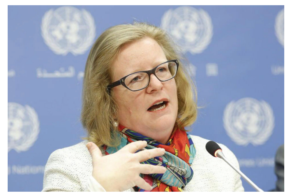
Christine Lins, Executive Secretary of Renewable Energy Policy Network for the 21st Century (REN21).

The <u>Renewables Global Futures Report: Great debates towards 100 per cent renewable energy</u> also noted that more than 70 per cent of the experts expressed that a global transition to 100 per cent renewable energy is both feasible and realistic, with European and Australian experts most strongly supporting this view.