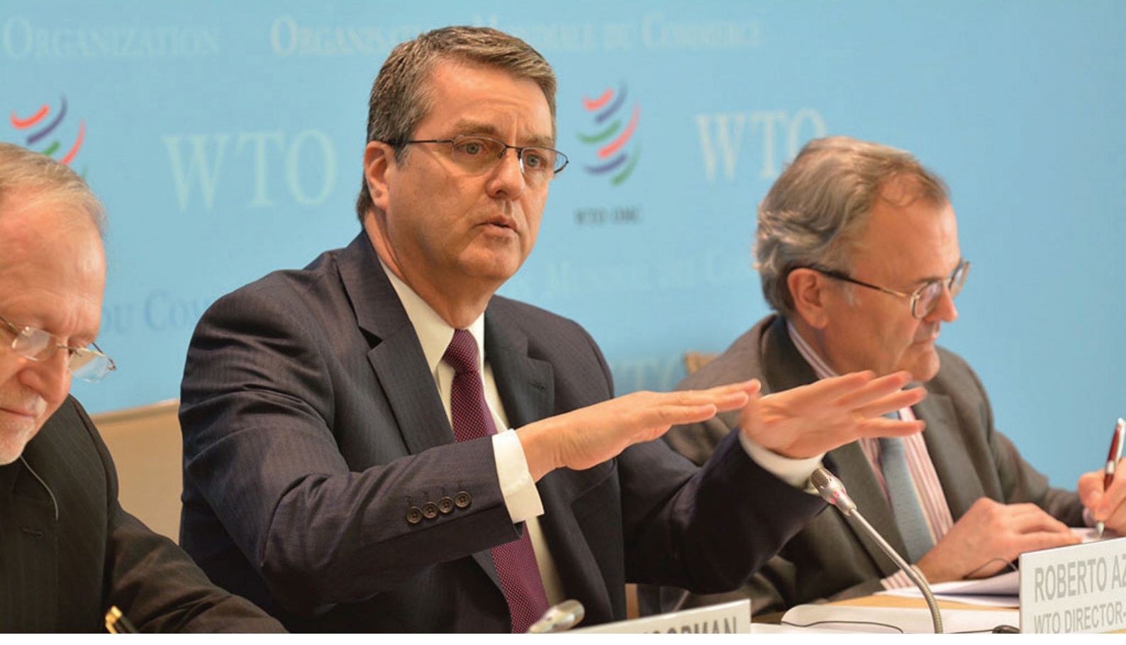
World Trade Organization (WTO) Director-General Roberto Azevêdo announcing the WTO's trade growth projections at a press conference in Geneva.