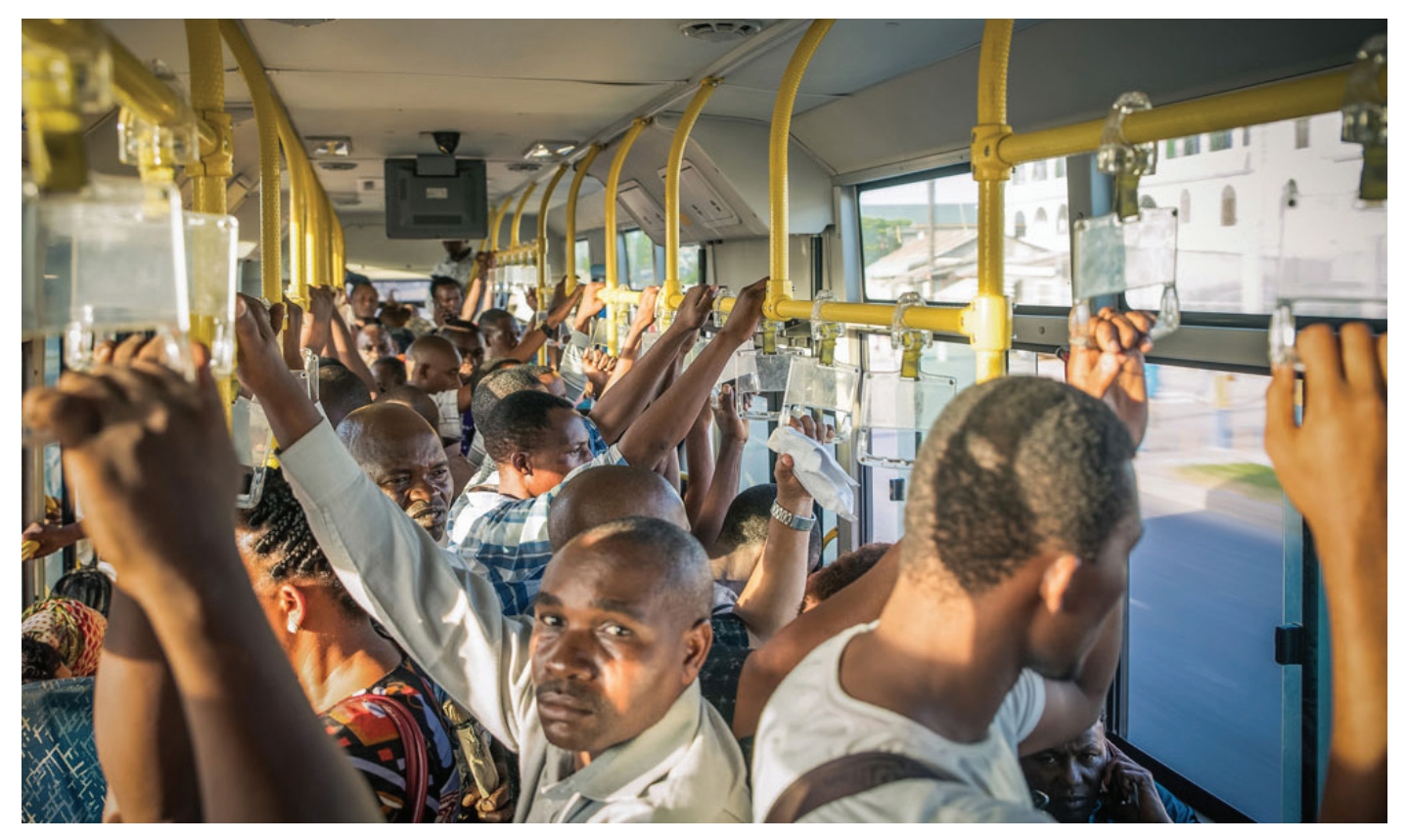
Dar es Salaam, Tanzania's commercial hub, is considered one of the fastest growing urban centres in the region, with a population that has been growing rapidly for more than a decade.

In ageing societies, social protection mechanisms, pension systems and health care programmes are being adjusted and strengthened. Women's participation in the workforce is being supported more than ever before, and some countries are slowly pushing up the age of retirement.