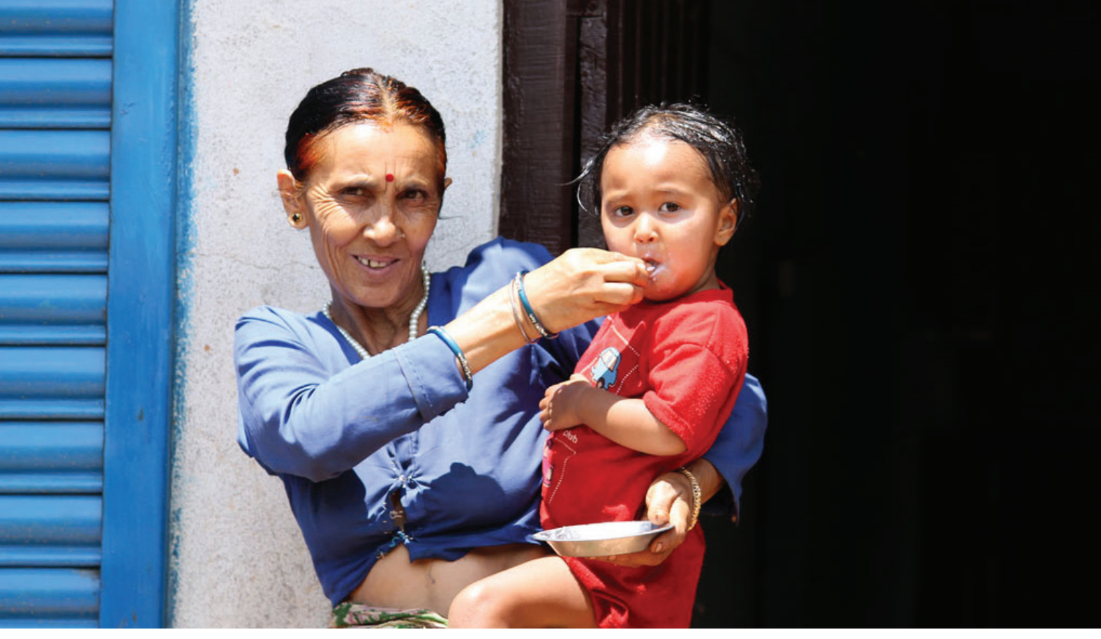
A grandmother feeds her two year old granddaughter in Naubise, Dhading. Nepal