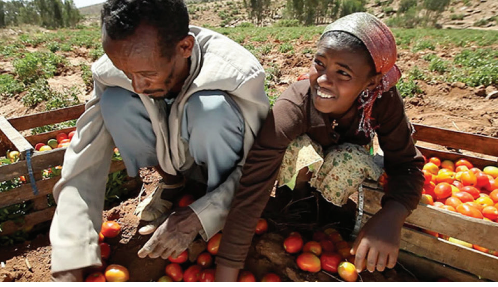
Farmers sort tomatoes in the Horn of African country Ethiopia.