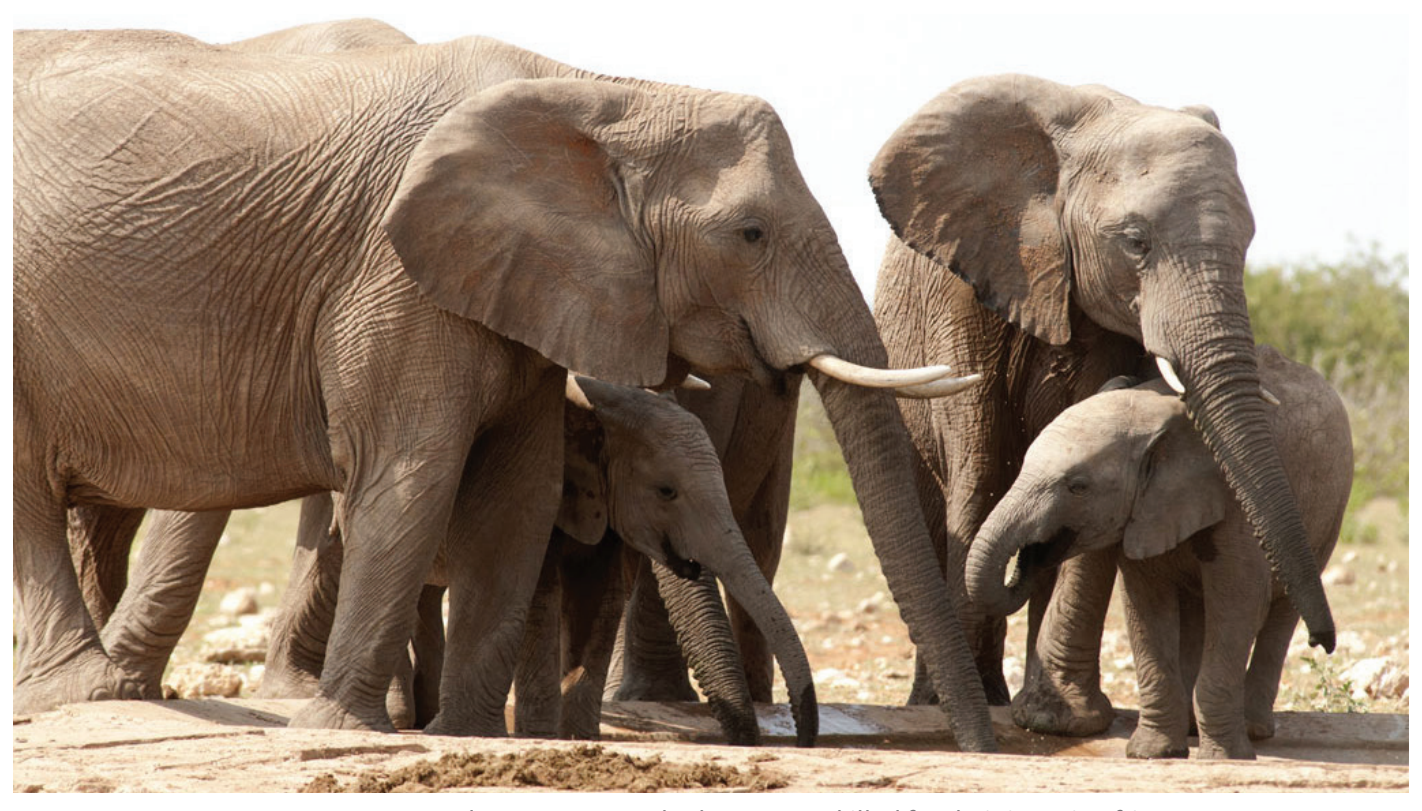
Between 2010 and 2012, 100,000 elephants were killed for their ivory in Africa.

United Nations, (UN News Centre) 3 April 2017 – Applauding the Chinese Government's closure of many of its ivory factories and retail outlets, the United Nations environment wing has called on other countries and territories to follow China's example and improve the survival prospects for elephants across the world.