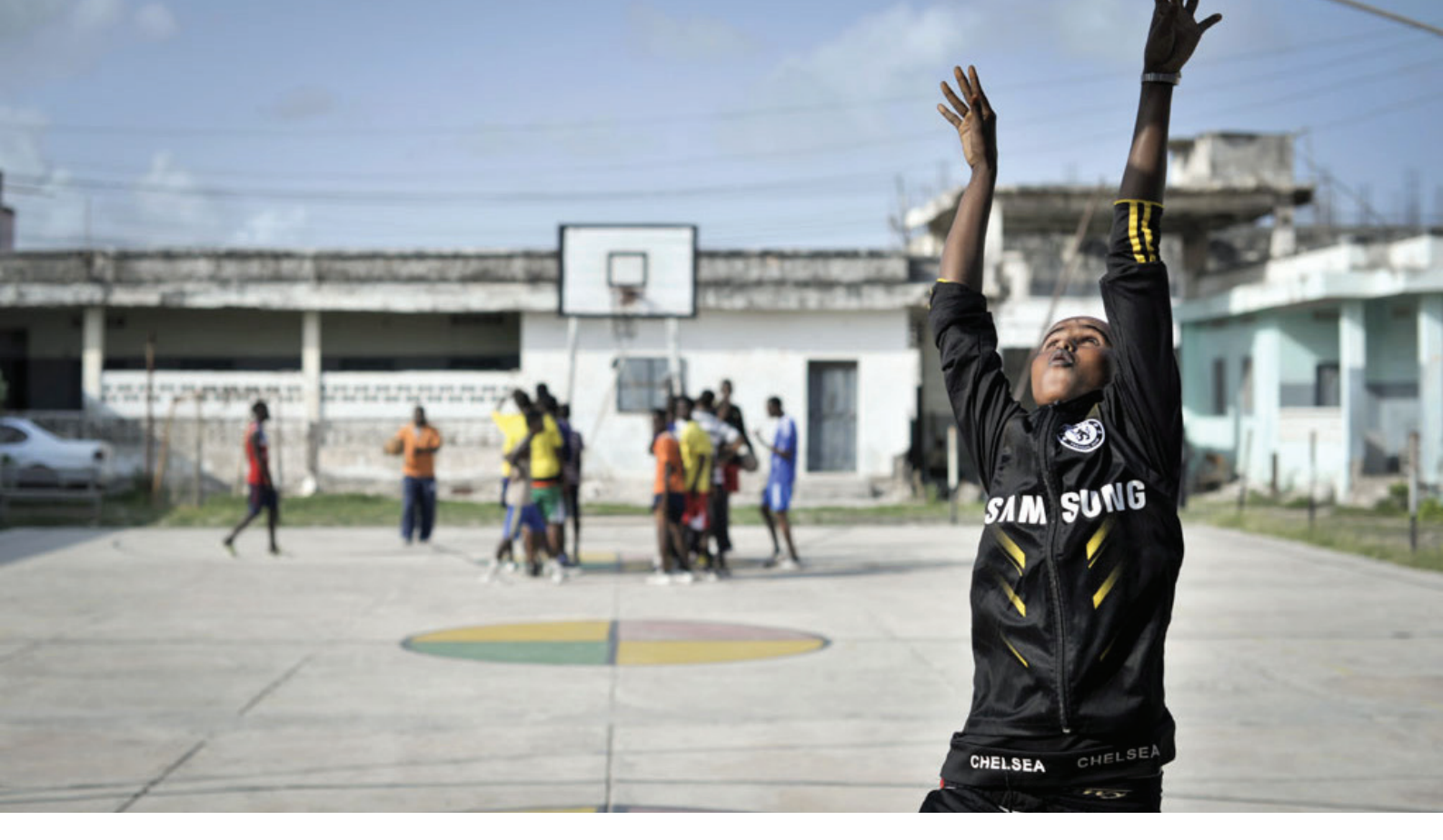
A girl takes a shot during a basketball training session in Mogadishu, Somalia.