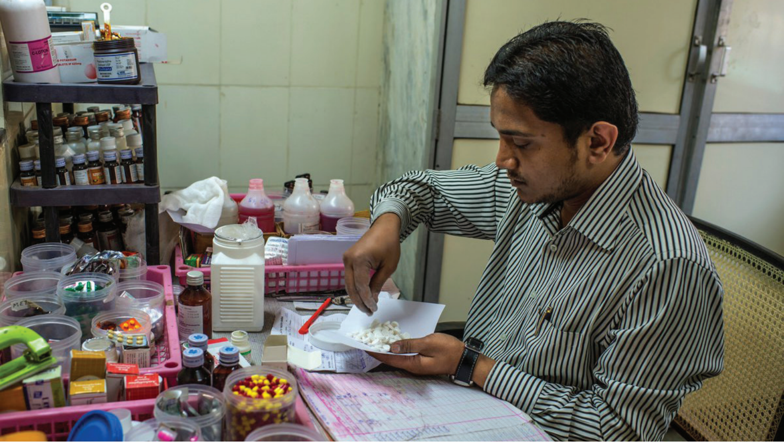
The World Health Organization's Global Patient Safety Challenge on Medication Safety lays out ways to improve the way medicines are prescribed, distributed & consumed.