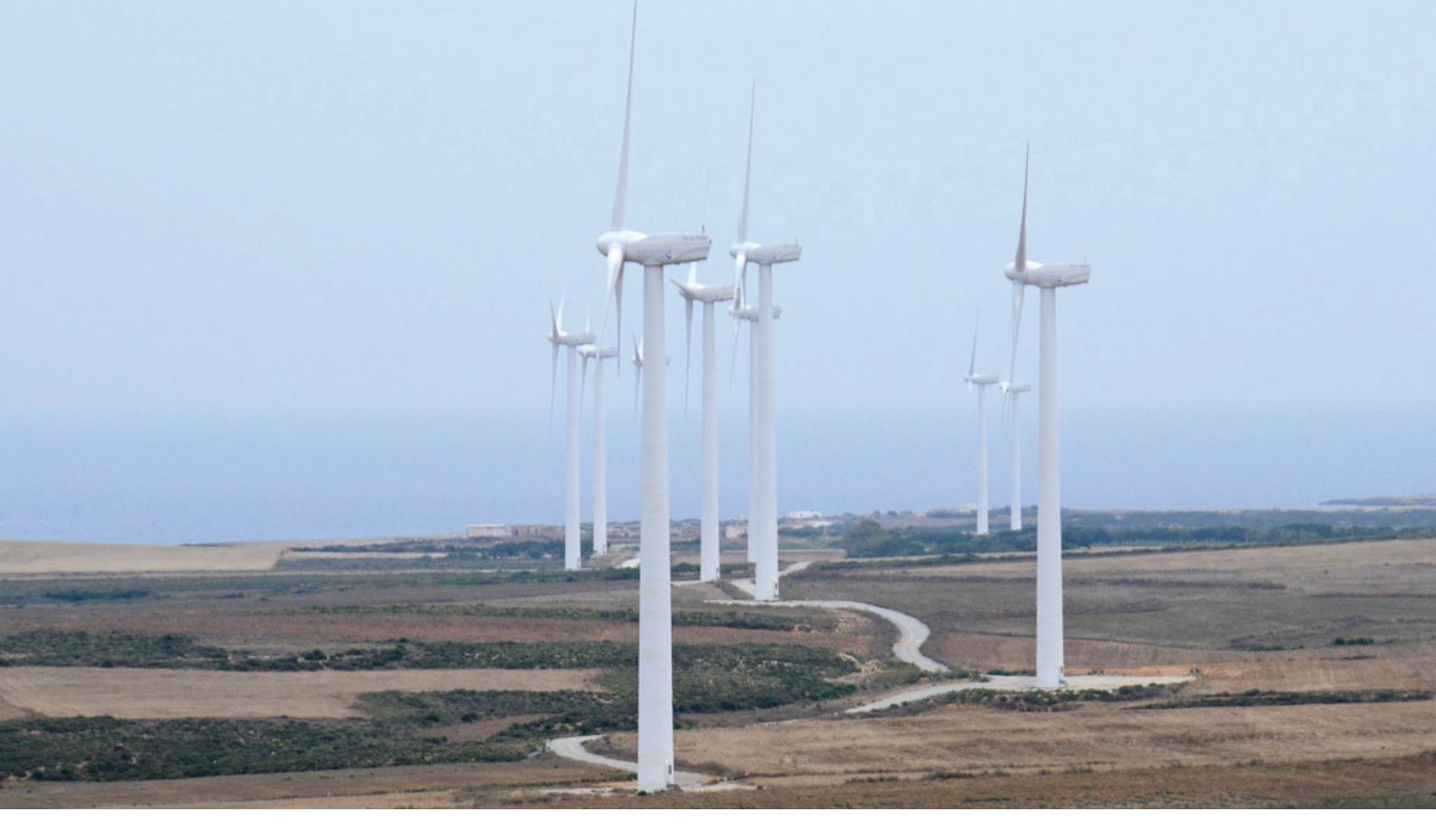
Sustainable energy.