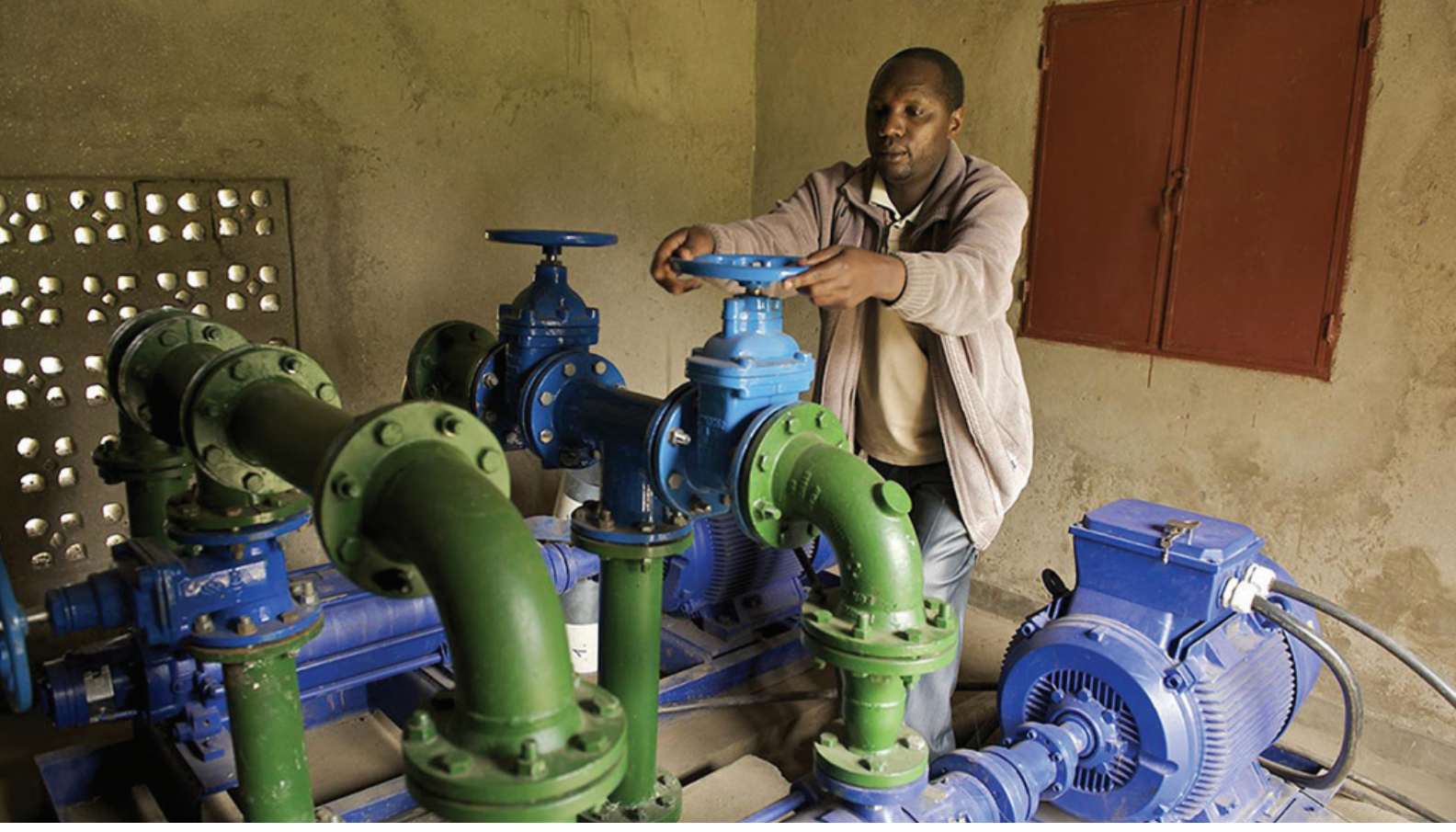
A technician releases water from the UNICEF supported source station that provides water to several villages in the region in Cyamabuye village in Myapihu district in northern Rwanda.