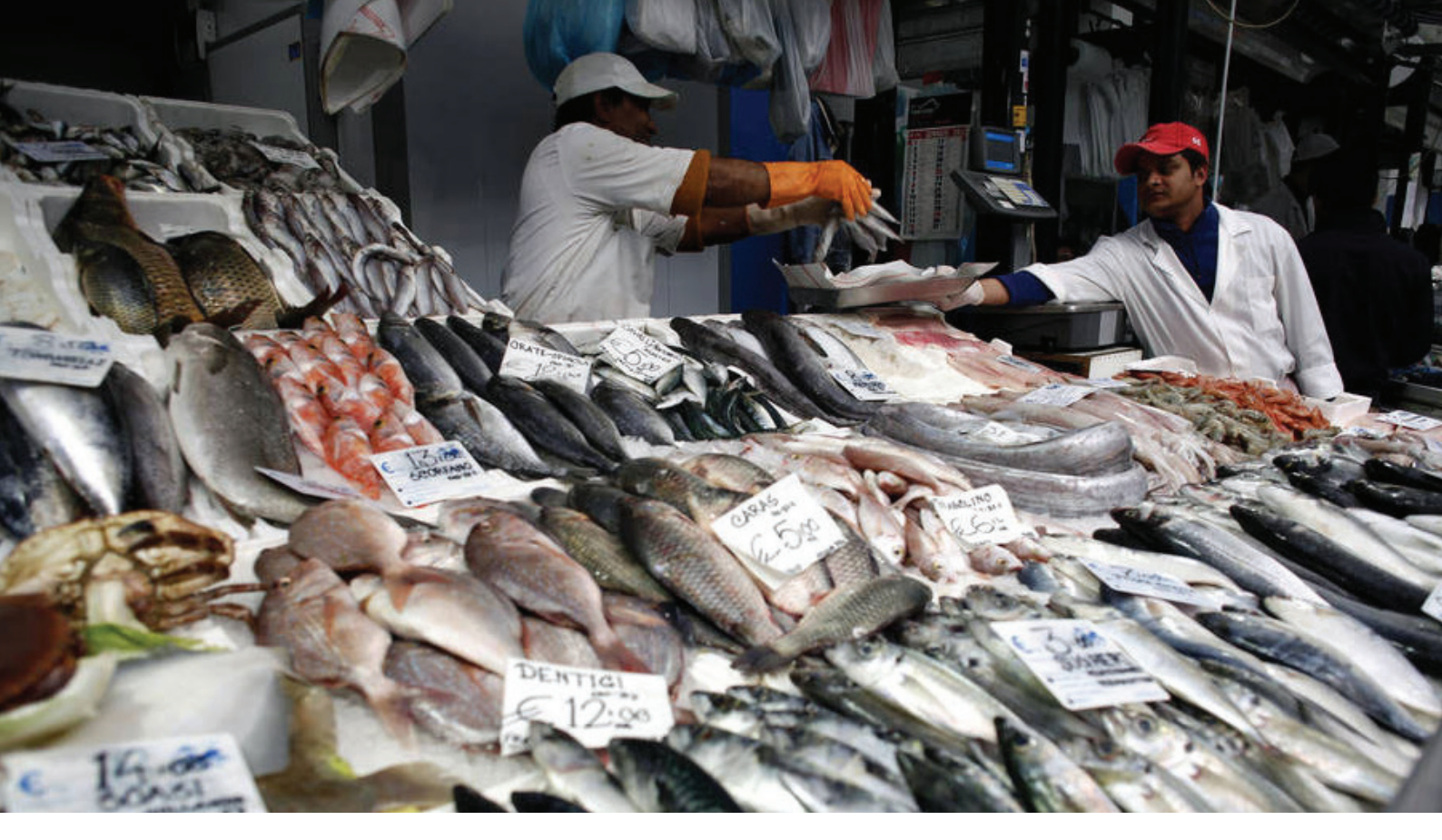
Fresh fish for sale at a market in Rome, Italy.